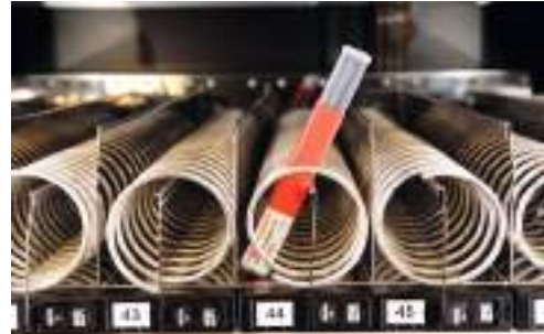
Helix with a half twist