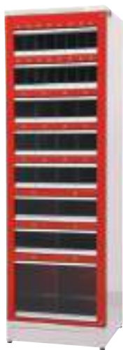
ORSY ® mat FP S34 S34 add-on module