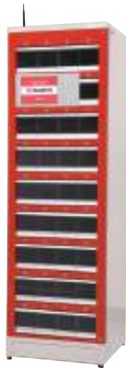
ORSY ® mat FP M33