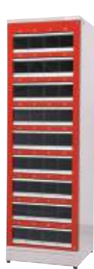
ORSY ® mat FP S36 S36 add-on module