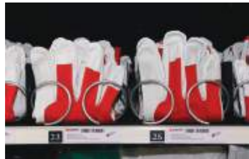
Helix with a double twist

ORSY ® mat HX (W x H x D) External dimensions: 88 x 200 x 88 cm