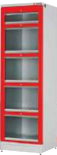
ORSY ® mat FP S5 S5 add-on module