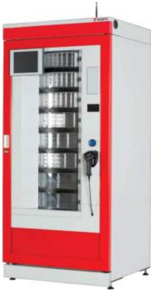
ORSY®mat RT M