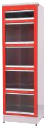
ORSY ® mat FP S10 S10 add-on module