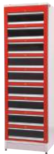
ORSY ® mat FP S9 S9 add-on module