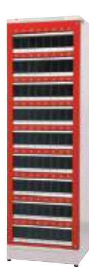
ORSY ® mat FP S72 S72 add-on module