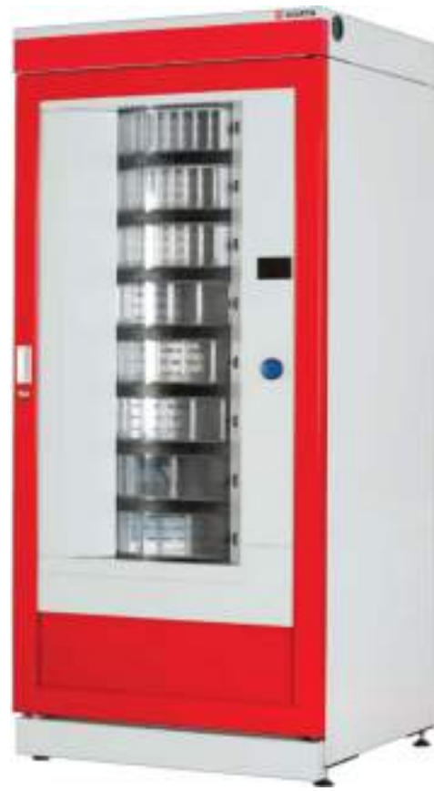
ORSY®mat RT S

You need more information? We will be happy to give you advice