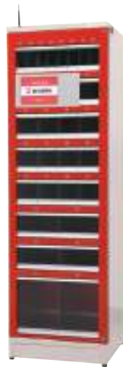
ORSY ® mat FP M27