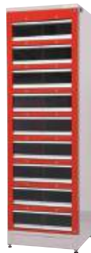
ORSY ® mat FP S18 S18 add-on module