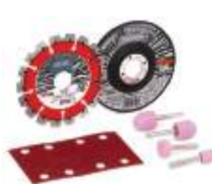
Cutting & Grinding Tools