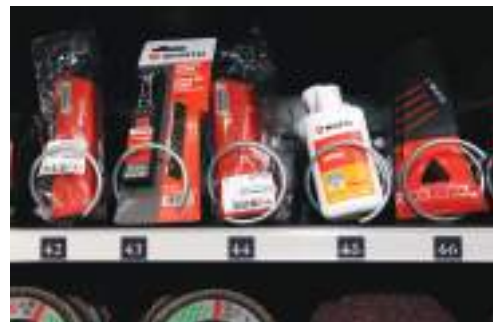
Helix with a single twist