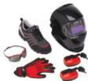
Personal Protective Equipment