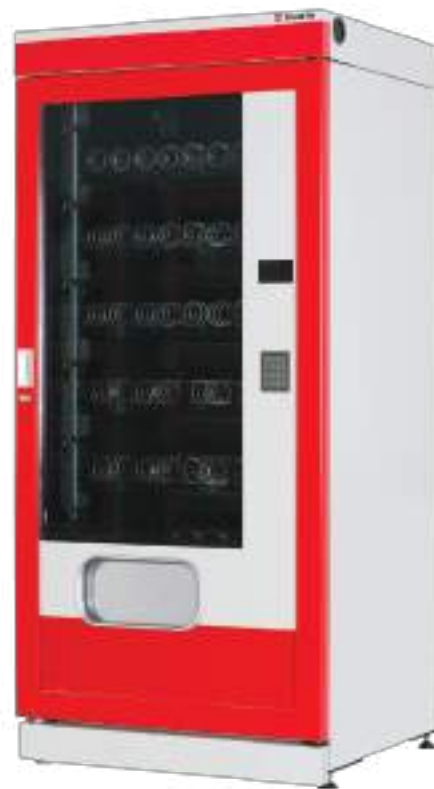
ORSY®mat HX S