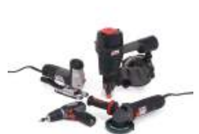
Electric & Pneumatic Tools