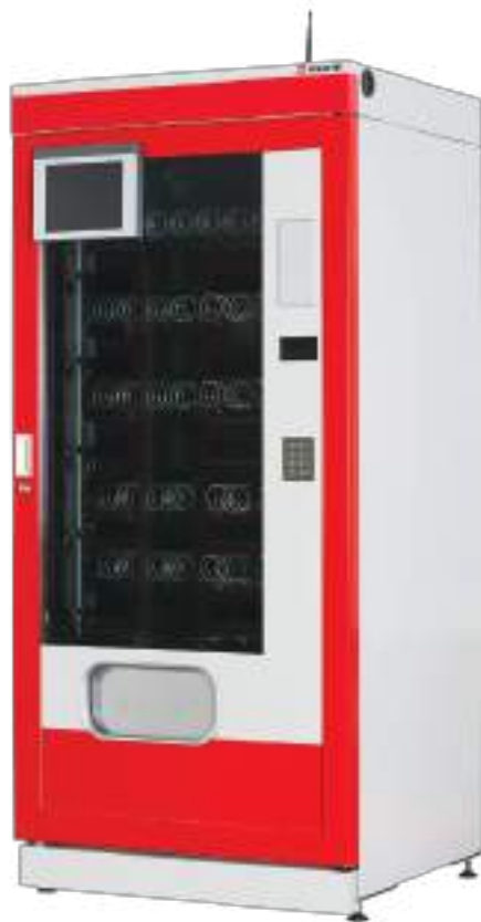
ORSY®mat HX M