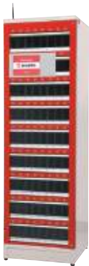
ORSY ® mat FP M65